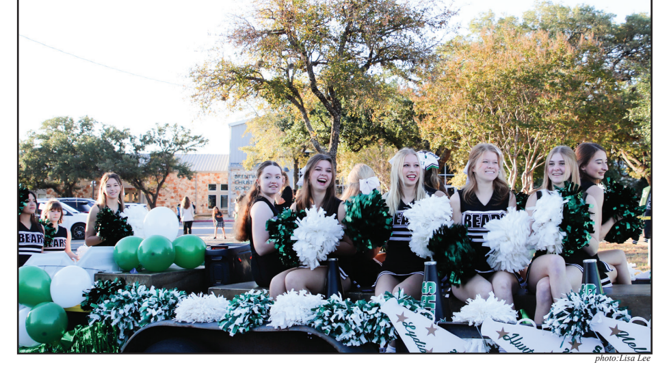
Smile and wave! The BCS cheer team laugh happily on their green-and-white covered float, which won second place overall in the parade held on Oct. 21.

StuCo began planning homecoming very early in the year, and they announced the dress-up days and theme through a video played during chapel. Students started off the week with a Marvelous Monday where they could dress up as a character from Marvel or as a celebrity going to the Oscars. Terrifying Tuesday offered a preview of Halloween, al-