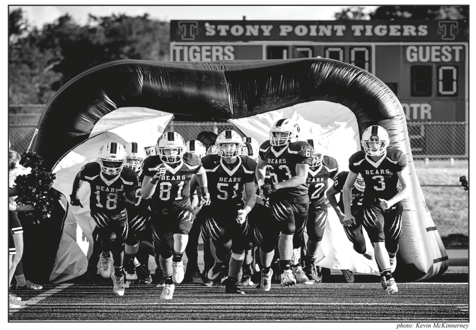
Your... Brentwood Bears! The Bears charge onto the field at the beginning of their first "home" game against CTCS, held at a neutral site due to issues with BCS home turf.