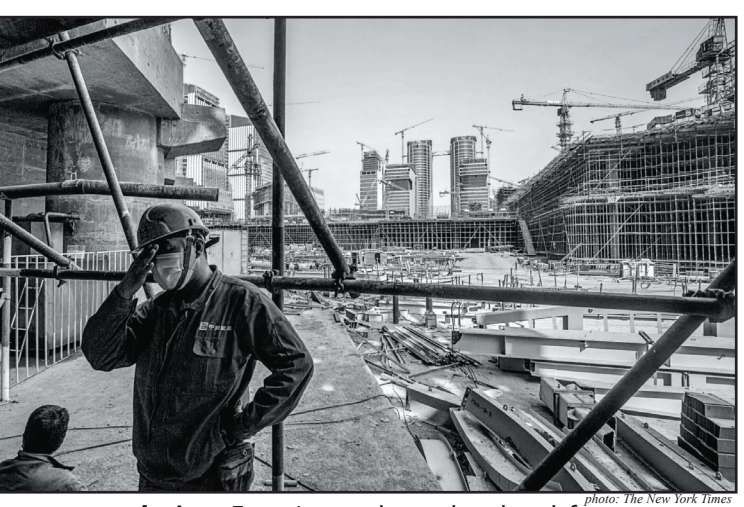
Forgone conclusions Egyptian workers take a break from construction of Egypt's Iconic Tower, planned to be the tallest in Africa.

It is not the first time that el-Sisi has taken loans and entered his country into debt for the completion of a shining new construction project that eventually fell short of promised revenue goals. Eight-lane highways, giant bridges spanning the Nile, an $8 billion extension to the