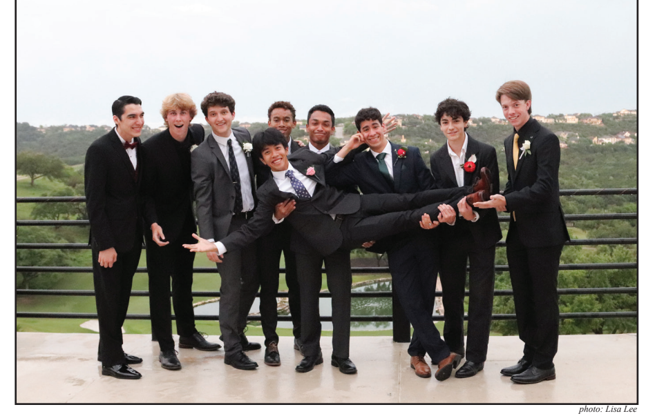
"Puttin' On the Ritz" Brentwood juniors and guests pose on the balcony of River Place Country Club, shortly after a line of thunderstorms rolled over the venue.