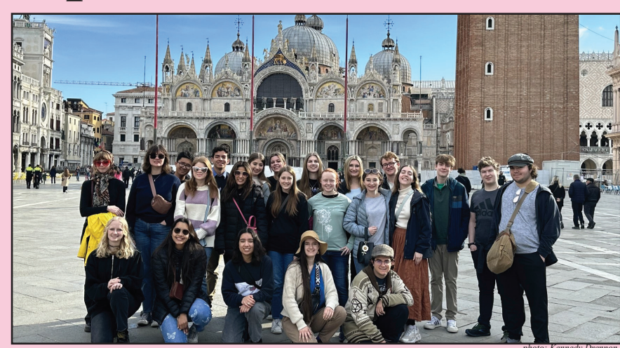
Abroad Brentwood's senior class of 2023 poses in front of the Doge's Palace, located in Venice, Italy, where the group of 23 spent three days.

Florence on March 15, touring the famous Uffizi Gallery and Piazza del Duomo. The seniors bid farewell to the city after just two days, heading further inland on March 17 to Venice, stopping in Shakespeare's "fair Ve-