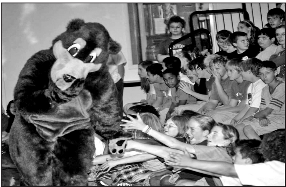
FUZZY WUZZY “The Bear” entertains students at last month’s pep rally.